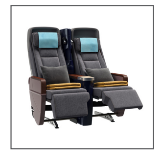
Consumer furniture with integrated electronics