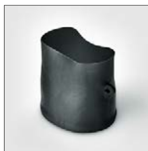
Formgods før krympning.