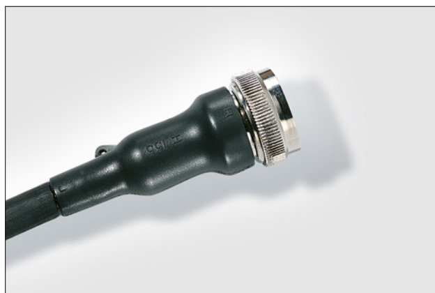
Formgods 150-serien med stik.

For information om materiale / lim se venligst side 244.