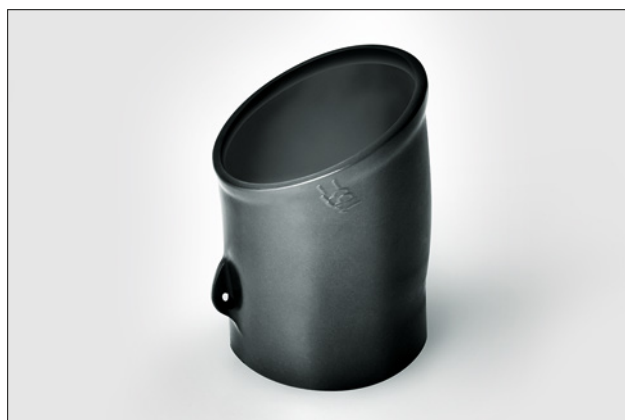
Helashrink 1152-4-G som leveret.