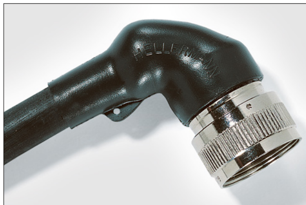
Helashrink 1152-4-G efter krympning.