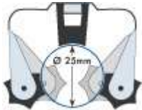
Art.-Nr.: 1-25 Federstahldicke 0,5 mm