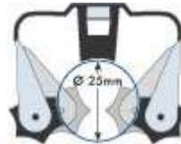
Art.-Nr.: 1-V25 Federstahldicke 0,8 mm