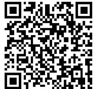
LH Car (for Android)