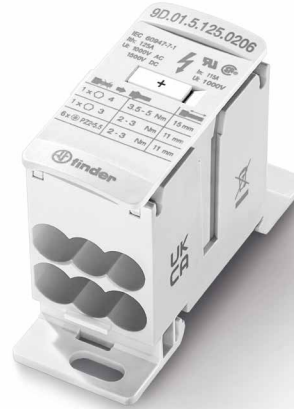
Type 9D.01.5.080.0304 Type 9D.01.5.125.0206 Type 9D.01.5.175.0210