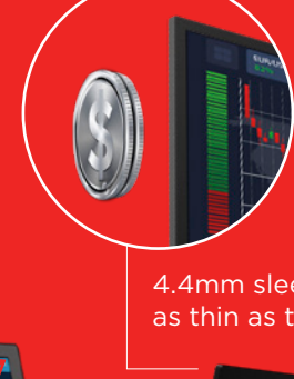
4.4mm sleek: approximately as thin as two USD $1 coins

The ThinkVision M14 boosts productivity with its thin and light form factor. Weighing 570g, this 4.4mm sleek mobile monitor enables easy portability. The stylish design with a Full HD, IPS display provides vivid lifelike visuals, ensuring you never miss out on any detail. With a brightness of 300 nits, the ThinkVision M14 offers a stunning visual experience while consuming content online.