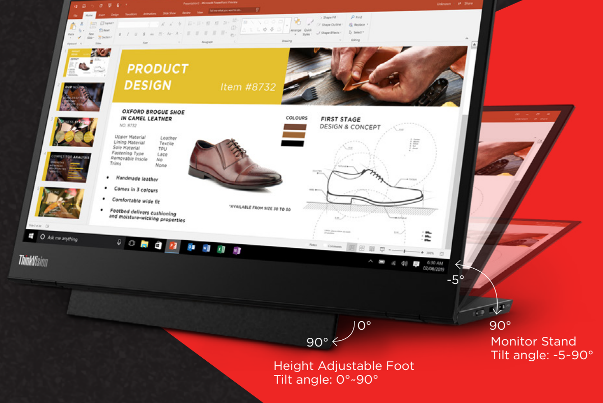
Height Adjustable Foot Tilt angle: 0°-90°