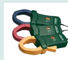
Model PQ3120 1000A Current Clamp Probes with 2.2" (55mm) jaw opening

1200A (12"/304mm) or 3000A (24"/609mm) Flexible Current Clamp Probes for wrapping around busbars