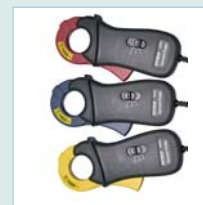
Model PQ3110 100A Current Clamp Probes with 1.2" (30mm) jaw size