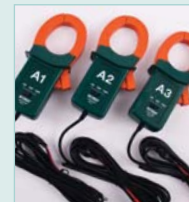
Model PQ34-12 1200A Current Clamp Probes with 2" (50mm) jaw opening