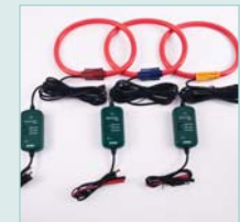
Model PQ34-30 3000A (24"/600mm) Flexible Current Clamp Probes for wrapping around busbars