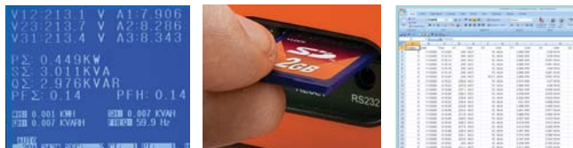
Backlit LCD displays numerical values. The data can be stored in SD memory card (included) and then transferred from meter to PC using Excel ® software and datalogged readings.

Complete with 4 voltage leads with alligator clips, 8 AA batteries, SD memory card, Universal AC adaptor (100 to 240V), and case. Clamp probes sold separately.