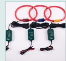
Model PQ34-30 3000A (24"/600mm) Flexible Current Clamp Probes for wrapping around busbars