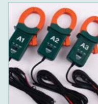
Model PQ34-12 1200A Current Clamp Probes with 2" (50mm) jaw opening