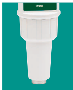
Magnetic base included