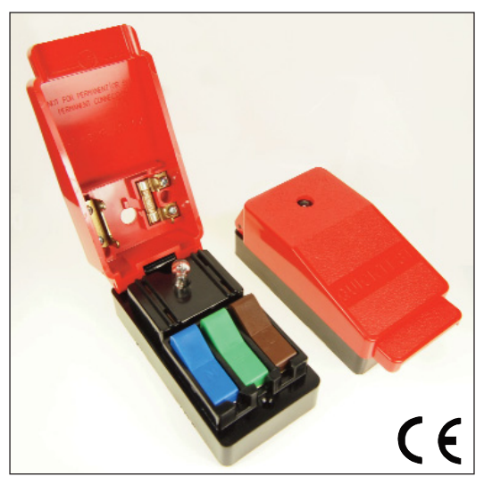
CL 1850 - QUICKTEST QT/1

The Quicktest is ideal for electrical shops, factories, labs and service departments.