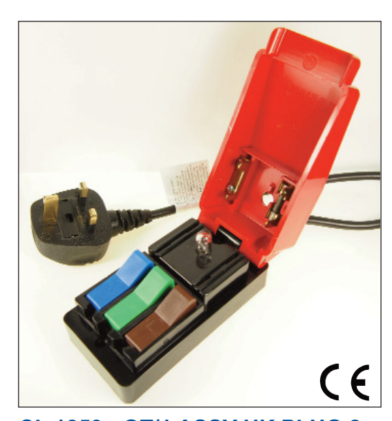
CL 1853 - QT/1 ASSY UK PLUG 2m

CL1860 - Quicktest QT/1 with 1.5m cable to Euro plug.