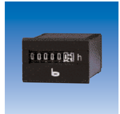
type 250, 250.1, 250.2, 260, 260.1, 260.2