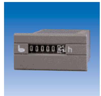
type 253, 253.1, 253.2, 263, 263.1, 263.2