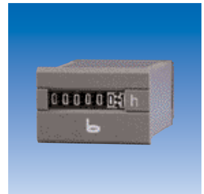
type 251, 251.1, 251.2, 261, 261.1, 261.2