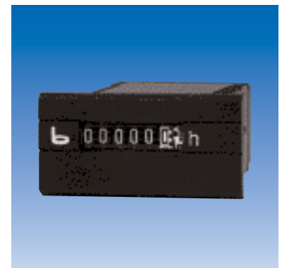
type 252, 252.1, 252.2, 262, 262.1, 262.2