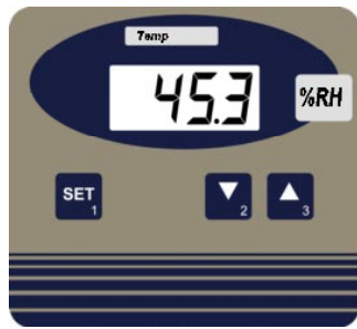
display relative air humidity

During normal operation the relative air humidity in [%RH] is displayed alternating to the temperature in [°C] or [°F].