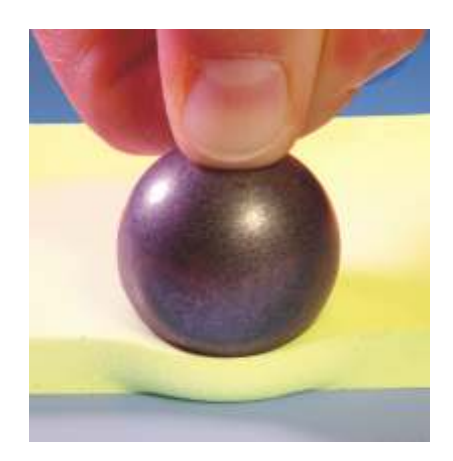
The following thicknesses are available: 0,5 - 5,0 mm