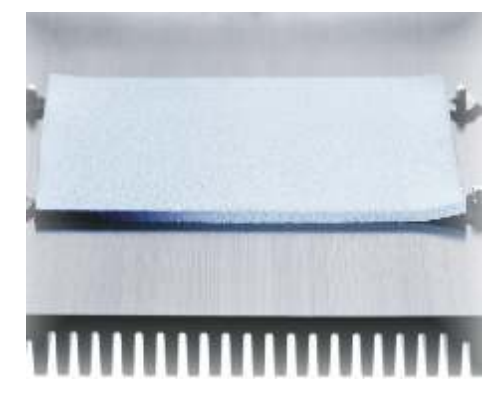
Optional available with adhesive coating! The following film thicknesses are available:

86/300: 0.5 - 5.0 mm 86/500: 0.5 - 2.0 mm