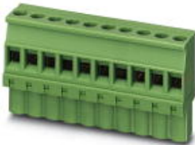
Plug component, Nominal current: 16 A, Rated voltage (III/2): 320 V, Number of positions: 2, Pitch: 5.08 mm, Connection method: Screw connection, Color: green, Contact surface: Tin

Please be informed that the data shown in this PDF Document is generated from our Online Catalog. Please find the complete data in the user's documentation. Our General Terms of Use for Downloads are valid ( http://download.phoenixcontact.com )