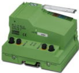
INTERBUS bus coupler, with fiber optic connection, 24 V DC, transmission speed 2 Mbaud, complete with accessories (plug and labeling field)

Please be informed that the data shown in this PDF Document is generated from our Online Catalog. Please find the complete data in the user's documentation. Our General Terms of Use for Downloads are valid ( http://download.phoenixcontact.com )