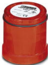
LED permanent light element, 24 V AC/DC, red

Please be informed that the data shown in this PDF Document is generated from our Online Catalog. Please find the complete data in the user's documentation. Our General Terms of Use for Downloads are valid ( http://download.phoenixcontact.com )