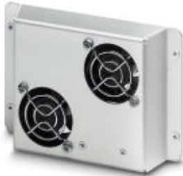
Fan module for Remote Field Controllers RFC 430 ETH-IB / RFC 450 ETH-IB

Please be informed that the data shown in this PDF Document is generated from our Online Catalog. Please find the complete data in the user's documentation. Our General Terms of Use for Downloads are valid ( http://download.phoenixcontact.com )