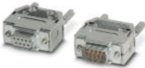
Bus connector set, solder connection, male/female connector

Please be informed that the data shown in this PDF Document is generated from our Online Catalog. Please find the complete data in the user's documentation. Our General Terms of Use for Downloads are valid ( http://download.phoenixcontact.com )