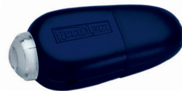
Fig. 1: Lamp LED 2000, Type 40527..., blue version

This attractively shaped, powerful rechargeable LED lamp, AccuLux LED 2000, is inspired by the world's first rechargeable torch features state of the art technology. It convinces with its white light emitting diode (daylight-like light), high light-intensity and very low energy consumption. The impact resistant light emitting diode stands out for its virtually unlimited service life. The LED 2000 guarantees pre-focused, daylight-like lighting with proper definition and uniformity of the beam. The lamp can be recharged up to 1 000 times. The built-in, environmentally friendly NiMH battery does not show any memory effect, can be charged continuously and is protected against total discharge by the intelligent charger circuit. The extremely light-weight casing consists of impact-resistant and robust plastics and the integrated power plug ensures flexibility and mobility.