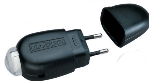
Fig. 2: Lamp LED 2000, Type 40528..., black version