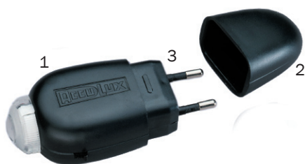
Fig. 3: Included in delivery LED 2000, Type 4052...