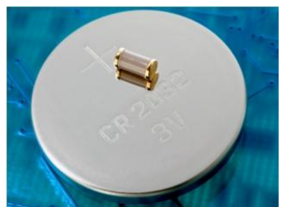
Nano-power, omnidirectional, ultra miniature, SMT