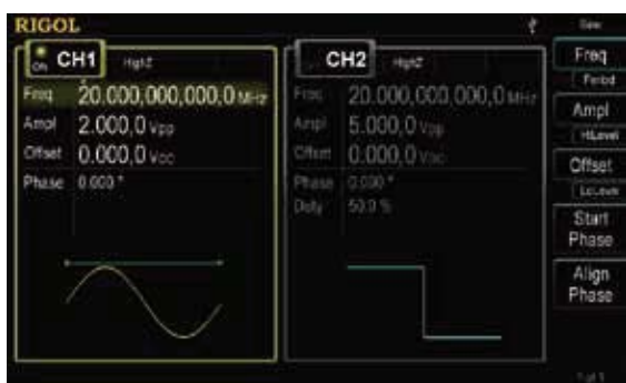
Standard identical 2 channels with frequency and phase coupling