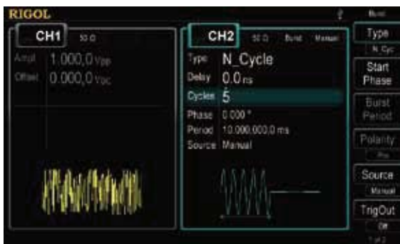
Noise and Burst modes