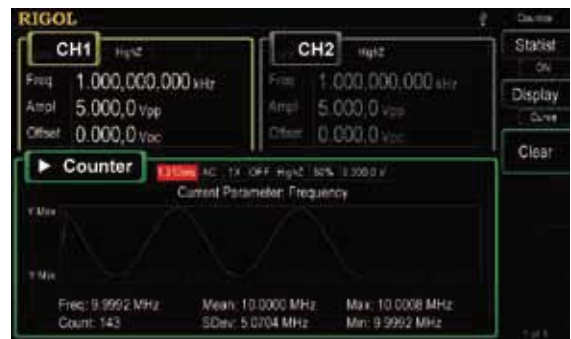
The statistic analysis function of counter