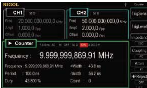
Standard high resolution counter function