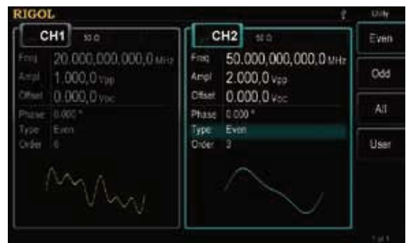
Up to 16 orders customized Harmonic generation function