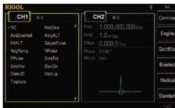
Arbitrary waveform function and built-in 150 waveforms