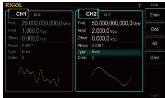
Up to 16 orders customized Harmonic generation function