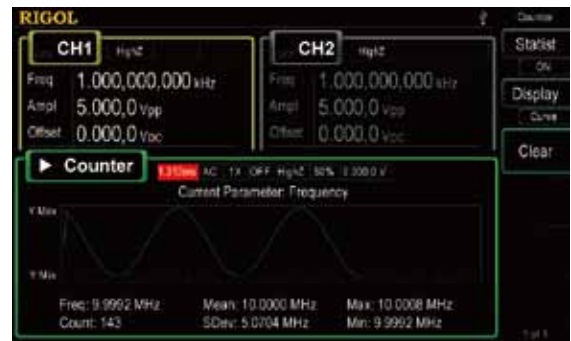
The statistic analysis function of counter