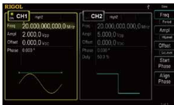
Standard identical 2 channels with frequency and phase coupling