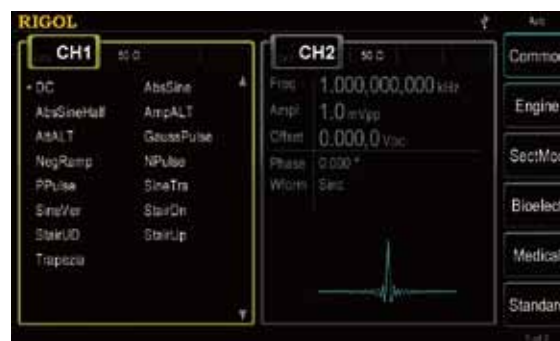
Arbitrary waveform function and built-in 150 waveforms