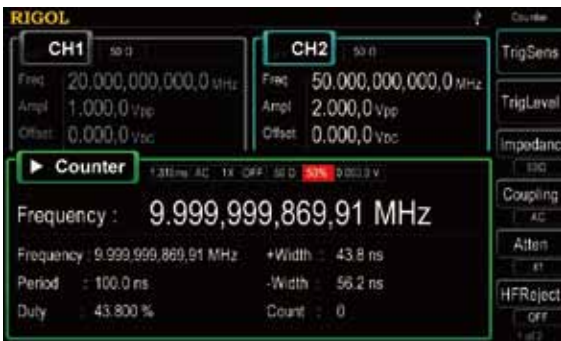
Standard high resolution counter function