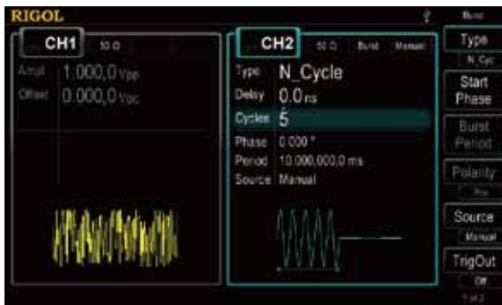
Noise and Burst modes