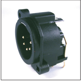
CP 300255 5XNACM/PC90 5 PIN MALE XLR 90° PCB MOUNT