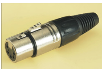
FC6165 5APF/M 5 Pole Female Plug Screw up collet, 6 element cable clamp