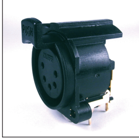
CP 300405 5XNACF/PC90/L 5 PIN FEMALE XLR 90° PCB MOUNT WITH LATCH