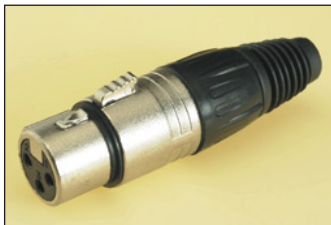
FC6140 3APF/M 3 Pole Female Plug Screw up collet, 6 element cable clamp