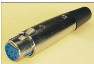
FC6182 7APF/M 7 Pole Female Plug Screw pressure cable clamp