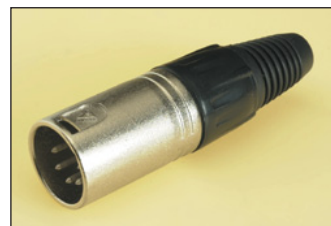
FC6160 5APM/M 5 Pole Male Plug Screw up collet, 6 element cable clamp