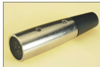
FC6180 7APM/M 7 Pole Male Plug Screw pressure cable clamp