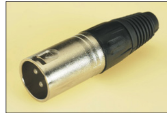
FC6130 3APM/M 3 Pole Male Plug Screw up collet, 6 element cable clamp