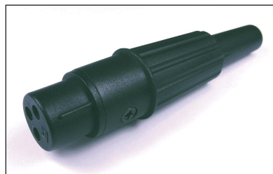
CP3003 APF FEMALE XLR PLUG