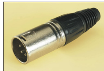
FC6155 4APM/M 4 Pole Male Plug Screw up collet, 6 element cable clamp