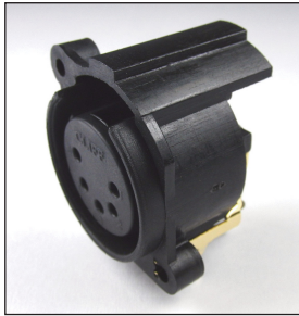
CP 300404 5XNACF/PC90 5 PIN MALE XLR 90° PCB MOUNT WITHOUT LATCH