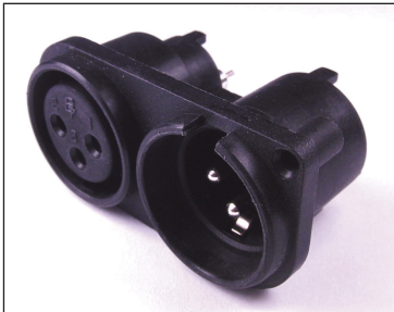
FB6928 MF/PCSXLR DUAL MALE / FEMALE XLR VERTICAL PC MOUNT