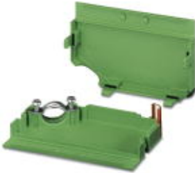
Cable housing, Pitch: 0 mm, Number of positions: 9, Dimension a: 45 mm, Color: green

Please be informed that the data shown in this PDF Document is generated from our Online Catalog. Please find the complete data in the user's documentation. Our General Terms of Use for Downloads are valid ( http://download.phoenixcontact.com )