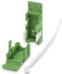
Cable housing, Pitch: 0 mm, Number of positions: 3, Dimension a: 15 mm, Color: green

Please be informed that the data shown in this PDF Document is generated from our Online Catalog. Please find the complete data in the user's documentation. Our General Terms of Use for Downloads are valid ( http://download.phoenixcontact.com )