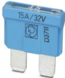
Flat-type plug-in fuse, type C, color code: light brown, nominal current: 5 A

Please be informed that the data shown in this PDF Document is generated from our Online Catalog. Please find the complete data in the user's documentation. Our General Terms of Use for Downloads are valid ( http://download.phoenixcontact.com )