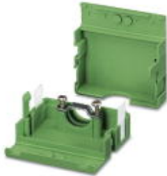
Cable housing, Pitch: 0 mm, Number of positions: 6, Dimension a: 30 mm, Color: green

Please be informed that the data shown in this PDF Document is generated from our Online Catalog. Please find the complete data in the user's documentation. Our General Terms of Use for Downloads are valid ( http://download.phoenixcontact.com )