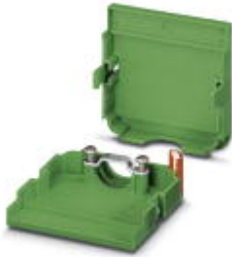
Cable housing, Pitch: 3.81 mm, Number of positions: 13, Dimension a: 51.92 mm, Color: green

Please be informed that the data shown in this PDF Document is generated from our Online Catalog. Please find the complete data in the user's documentation. Our General Terms of Use for Downloads are valid ( http://download.phoenixcontact.com )