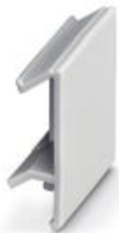
Filler plug for unoccupied terminal points, color: Light gray

Please be informed that the data shown in this PDF Document is generated from our Online Catalog. Please find the complete data in the user's documentation. Our General Terms of Use for Downloads are valid ( http://download.phoenixcontact.com )