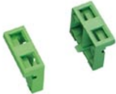
Side element, with marker groove, labeling with SS-ZB. Width: 11 mm, length: 25 mm, height: 21 mm

Please be informed that the data shown in this PDF Document is generated from our Online Catalog. Please find the complete data in the user's documentation. Our General Terms of Use for Downloads are valid ( http://download.phoenixcontact.com )