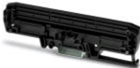
Lateral element (left) with mounting foot for DIN rails for 72 mm wide UM-PRO profiles

Please be informed that the data shown in this PDF Document is generated from our Online Catalog. Please find the complete data in the user's documentation. Our General Terms of Use for Downloads are valid ( http://download.phoenixcontact.com )