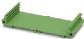
Drawn section panel mounting base, with a constructional width of 108 mm and a fixed length of 100 cm

Please be informed that the data shown in this PDF Document is generated from our Online Catalog. Please find the complete data in the user's documentation. Our General Terms of Use for Downloads are valid ( http://download.phoenixcontact.com )