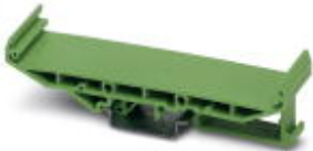
Base element with snap-on foot, for mounting on NS 32 or NS 35/7.5 DIN rail, without ribs, L = 35 mm

Please be informed that the data shown in this PDF Document is generated from our Online Catalog. Please find the complete data in the user's documentation. Our General Terms of Use for Downloads are valid ( http://download.phoenixcontact.com )