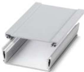
Panel mounting base, Lower part, Color: aluminum, Width: 200 mm

Please be informed that the data shown in this PDF Document is generated from our Online Catalog. Please find the complete data in the user's documentation. Our General Terms of Use for Downloads are valid ( http://download.phoenixcontact.com )