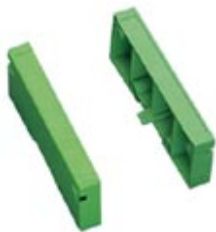
Side element, without marker groove, labeling with SS-ZB. Width: 6 mm, length: 45 mm, height: 21 mm

Please be informed that the data shown in this PDF Document is generated from our Online Catalog. Please find the complete data in the user's documentation. Our General Terms of Use for Downloads are valid ( http://download.phoenixcontact.com )