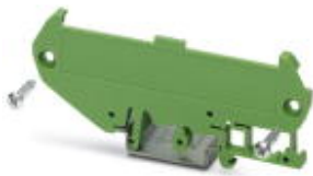
Side element, left, with foot, width: 5 mm, length: 72 mm, for mounting on NS 32 or NS 35/7.5

Please be informed that the data shown in this PDF Document is generated from our Online Catalog. Please find the complete data in the user's documentation. Our General Terms of Use for Downloads are valid ( http://download.phoenixcontact.com )