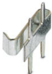
PCB stop, for soldering onto PCB

Please be informed that the data shown in this PDF Document is generated from our Online Catalog. Please find the complete data in the user's documentation. Our General Terms of Use for Downloads are valid ( http://download.phoenixcontact.com )