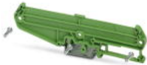
Side element with foot, 5 mm wide (right), for mounting on NS 32 or NS 35/7.5. PCB width: 107.5 mm

Please be informed that the data shown in this PDF Document is generated from our Online Catalog. Please find the complete data in the user's documentation. Our General Terms of Use for Downloads are valid ( http://download.phoenixcontact.com )