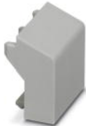
Filler plugs, for unoccupied terminal points

Please be informed that the data shown in this PDF Document is generated from our Online Catalog. Please find the complete data in the user's documentation. Our General Terms of Use for Downloads are valid ( http://download.phoenixcontact.com )