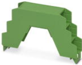
Upper part of housing, for COMBICON connection, three-level

Please be informed that the data shown in this PDF Document is generated from our Online Catalog. Please find the complete data in the user's documentation. Our General Terms of Use for Downloads are valid ( http://download.phoenixcontact.com )