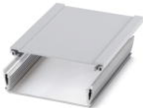
Panel mounting base, Lower part, Color: aluminum, Width: 200 mm

Please be informed that the data shown in this PDF Document is generated from our Online Catalog. Please find the complete data in the user's documentation. Our General Terms of Use for Downloads are valid ( http://download.phoenixcontact.com )