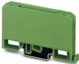
Electronic housing, with universal foot, without screw connection terminal blocks and cover

Please be informed that the data shown in this PDF Document is generated from our Online Catalog. Please find the complete data in the user's documentation. Our General Terms of Use for Downloads are valid ( http://download.phoenixcontact.com )