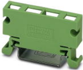
Side element with foot, however without PCB guide, labeling with SS-ZB, mounted along the length of the DIN rail NS 35/7.5. Height: 36 mm, width: 10 mm, length: 45 mm.

Please be informed that the data shown in this PDF Document is generated from our Online Catalog. Please find the complete data in the user's documentation. Our General Terms of Use for Downloads are valid ( http://download.phoenixcontact.com )