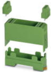
Electronic housing set, consisting of electronic housing and printed circuit termination blocks, pitch 5

Please be informed that the data shown in this PDF Document is generated from our Online Catalog. Please find the complete data in the user's documentation. Our General Terms of Use for Downloads are valid ( http://download.phoenixcontact.com )