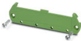
Side element, 5 mm wide, PCB width: 72 mm

Please be informed that the data shown in this PDF Document is generated from our Online Catalog. Please find the complete data in the user's documentation. Our General Terms of Use for Downloads are valid ( http://download.phoenixcontact.com )