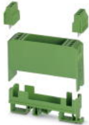
Electronic housing set, consisting of electronic housing and printed circuit termination blocks, pitch 5

Please be informed that the data shown in this PDF Document is generated from our Online Catalog. Please find the complete data in the user's documentation. Our General Terms of Use for Downloads are valid ( http://download.phoenixcontact.com )