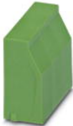
Filler plugs, for unoccupied terminal points

Please be informed that the data shown in this PDF Document is generated from our Online Catalog. Please find the complete data in the user's documentation. Our General Terms of Use for Downloads are valid ( http://download.phoenixcontact.com )